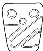
New (Lancer Evolution IX)